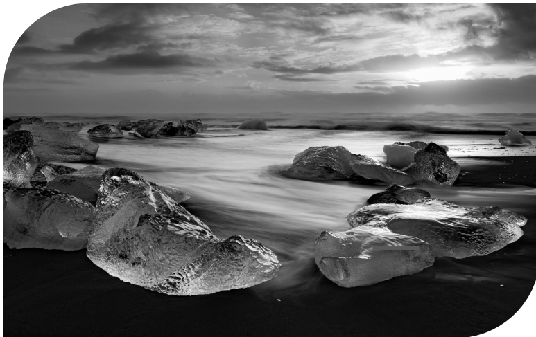
Diamond Beach Sharon Colacino

Congratulations to all whose images were selected for the winter competition. Keep in mind that more images will be needed for our spring submission. Those are needed by April 5th.